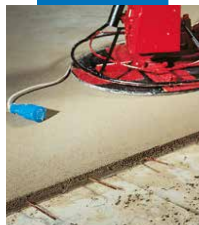
Power floating the surface of a Topcem screed