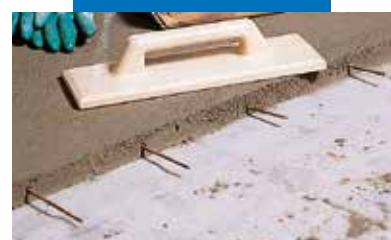
Detail of a Topcem screed with reinforcement rods