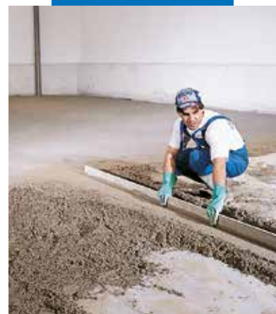
Preparing a levelling strip