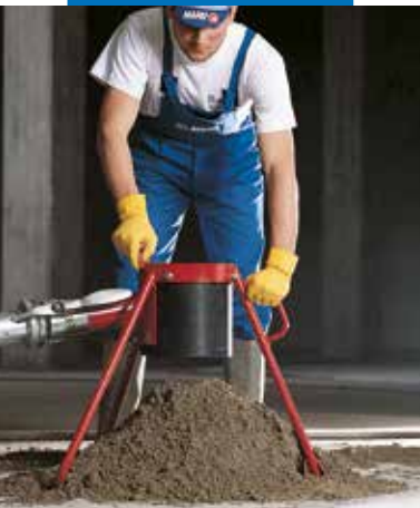
Batching a Topcem mix