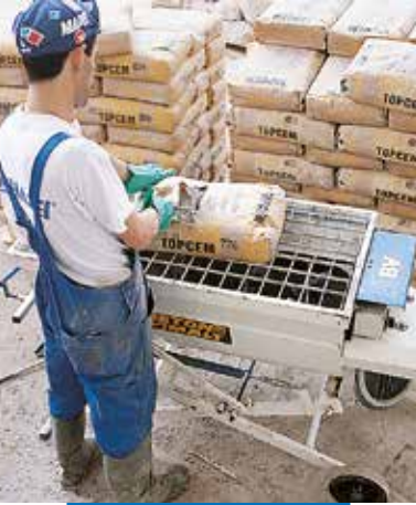
Mixing Topcem in a mini-batcher

Topcem contains cement that when in contact with sweat or other body fluids causes irritant alkaline reactions and allergic reactions to those predisposed. It can cause damage to eyes. It is recommended to use protective gloves and goggles and to take the usual precautions for handling chemicals. If the product comes in contact with the eyes or skin, wash immediately with plenty of water and seek medical attention.