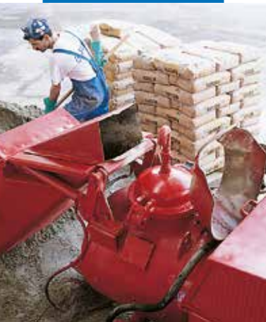
Mixing Topcem with an automatic pumping unit