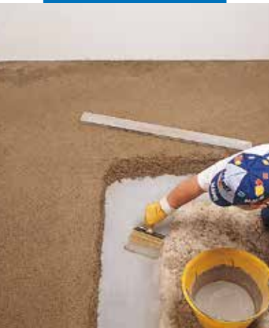
Spreading the anchoring slurry for bonded Topcem screeds